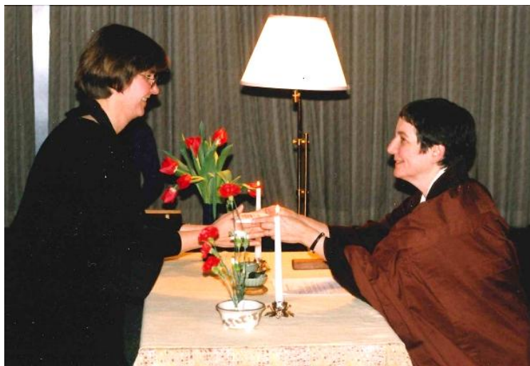
Lay ordination ceremony, 1999.

The Sixteen Bodhisattva Precepts include the Three Refuges, the Three Collective Pure Precepts, and the Ten Prohibitory Precepts. These are signposts of the Buddha Way as transmitted in Soto Zen. They have multiple levels of meaning, and can serve as a strong support as we navigate our lives in harmony with all beings and things.