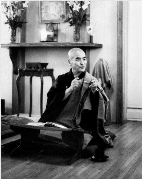
Dainin Katagiri Roshi, 1987.

Zen Master Eihei Dōgen's Fukanzazengi ("Universal Recommendation for Zazen") is a fundamental text of Sōtō Zen Buddhism. Composed in Japan in the 13th century, this short text explains both the how and the why of Zen meditation. It has meaning for practitioners in all walks of life, hence "Universal Recommendation." Traditionally it is recited every night during sesshin (meditation retreats).