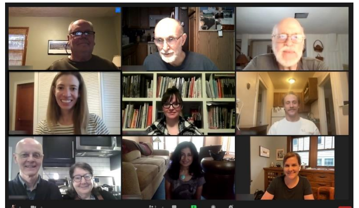
Board members gather via Zoom in July for their monthly board meeting.