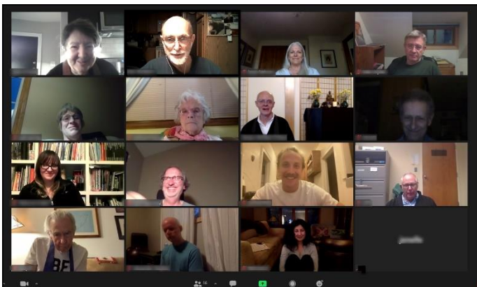
Participants in the summer Buddhist Studies course meet for their final class on July 28 th .